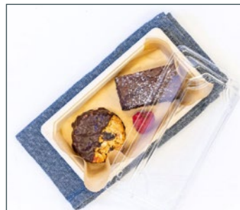
Duo Pack H

$7.50 (2 items per pack - min 6) Florentine + brownie (v) (gf)