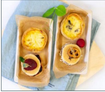
Duo Pack A

$6.95 (2 items per pack - min 6) Mushroom, garlic & thyme tart (v) + pancake stack (v)