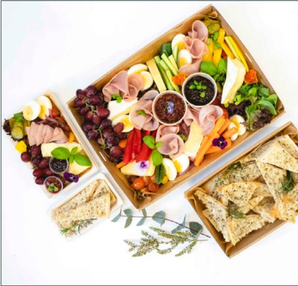
The ploughmans for 1 from $18.95

This grazer style board is perfect for anytime of the day. Leg ham, boiled egg, cheddar, brie cheese, veggie sticks, pickled vegetables, mixed salad, onion jam, chutney and grapes. Served with toasted Turkish bread.