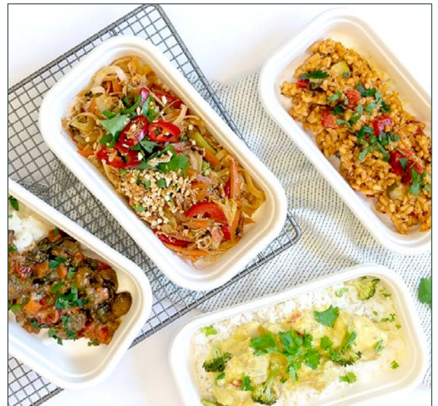
Individual Gourmet Meals $13.95 ea

The perfect meal-in-one for conferences, meetings, staff lunches / dinners or just a grab-on-the-run nutritious meal.