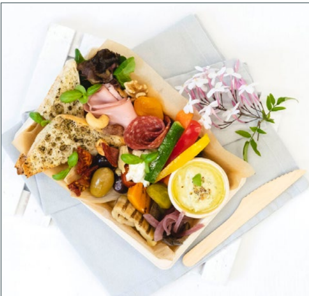
Grazer box for 1 $15.95 per box

A selection of garden crudité, cured meats, marinated & pickled vegetables, olives, feta, hummus & gourmet bread.