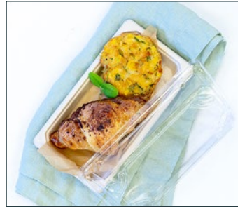
Duo Pack G

$10.50 (2 items per pack - min 6) Chocolate mousse croissant (v) + corn fritter (v)