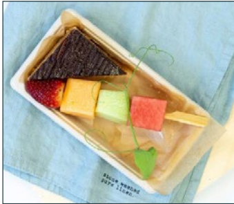
Duo Pack B

$6.95 (2 items per pack - min 6) Assorted cake (v) + fresh fruit skewer (vegan) (gf) (df) (n)