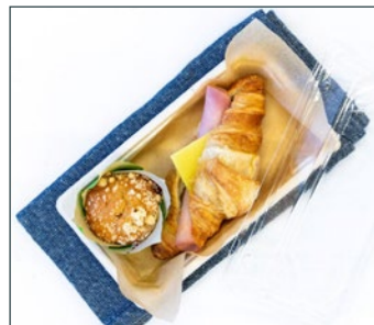
Duo Pack I

$7.50 (2 items per pack - min 6) Ham & cheese croissant + mini muffin