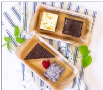
Duo Pack D

$7.50 (2 items per pack - min 6) Assorted cakes & slices x 2 (v)