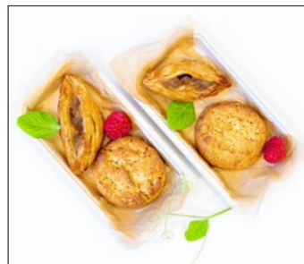
Duo Pack J

$6.50 (2 items per pack - min 6) Muesli cookie (vegan) + apple & cinnamon pastry taco (vegan)