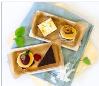
Duo Pack E

$6.95 (2 items per pack - min 6) Assorted cake (v) + pancake stack (v)