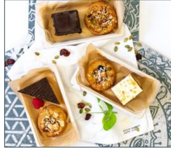
Duo Pack F

$6.95 (2 items per pack - min 6) Assorted cake (v) + muesli cookie (vegan) (df)