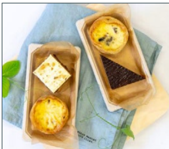
Duo Pack C

$7.50 (2 items per pack - min 6) Assorted cake (v) + mushroom, garlic & thyme tart (v)