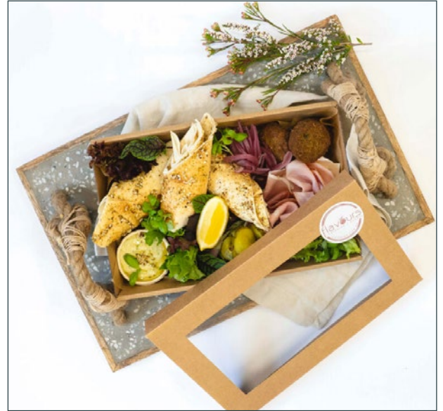
Mediterranean mezze box for 1 from $16.95 per box

A delicious meal in one – Cured meats, falafel, lemon & coriander hummus, pickled vegetables, leafy greens & Lebanese flat bread.