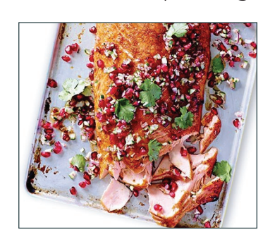
$190 Approx. 15 serves Served cold

Roasted salmon side, creme fraiche, chermoula, pomegranate (gf)